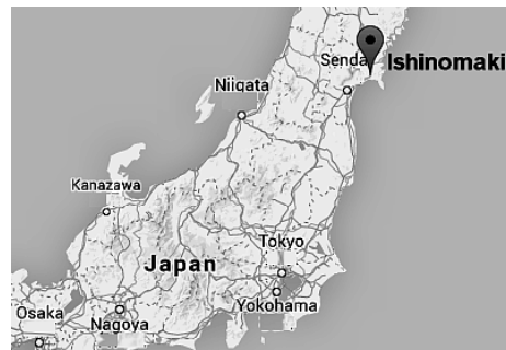
Ishinomaki Senshu University, Ishinomaki, Miyagi, 986-8580 Japan